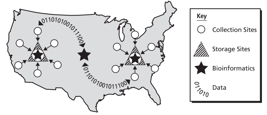
Figure 6.1 Centralized and Decentralized Repository Models

A. Decentralized Collection and Storage with Centralized Bioinformatics/Data Management