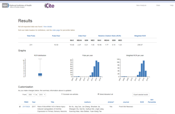
Figure 2. iCite results screen. Providing charts and bibliometrics for a portfolio of publications