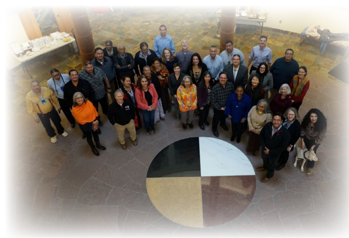
Traditional medicine practitioners, healers, and invitees.